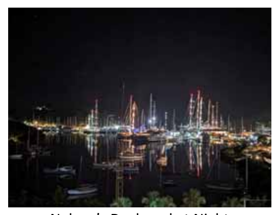
Nelson's Dockyard at Night

They say planning is the key to success. But life has taught me that a good raincoat and a good night's sleep are far more important to deal with life's surprises. Life is full of surprises. That was certainly true for this trip. I had brought a good raincoat, but a good night's sleep eluded me until the third night.