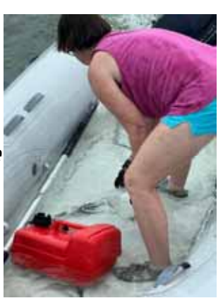
It rained a LOT!