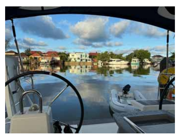
Jolly Harbour—The Calm After the Storm