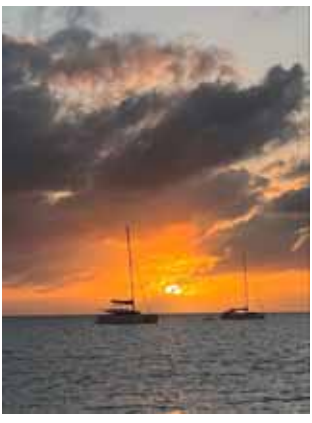
Five Island Harbour