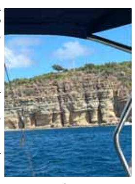
Pillars of Hercules (Continued on page 6)

The final sail back to English Harbour will remain in my memory as the very best! Blue skies, white puffy clouds and great wind! The Pillars of Hercules were impressive as we headed into the harbor. Nelson's Dockyard is gorgeous, and the work done to restore the old stone buildings from the 1700s was very much appreciated by everyone.