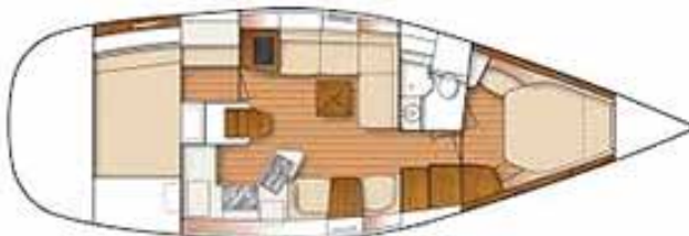
Silver Lining Catalina 385