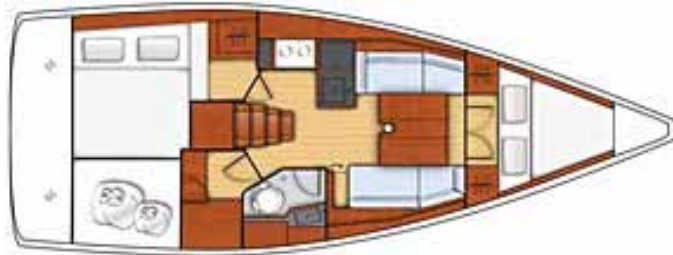
Honu , Odyssey and Si Certo

Three identical Beneteau 38.1 boats have been reserved for this adventure. All have spacious cabins, and heat!